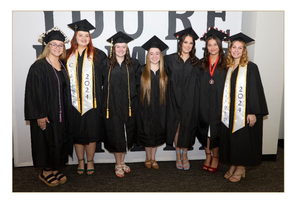
Photo: A few members of the 2023 Evening-Weekend program graduating class celebrate their commencement

Class of 2023 Commencement Evening/ Weekend Program at Believers Chapel in Cicero, New York.